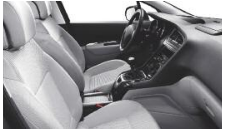
Strada Guérande Grey Cloth