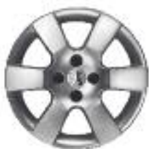
16" ERIS ALLOY WHEELS