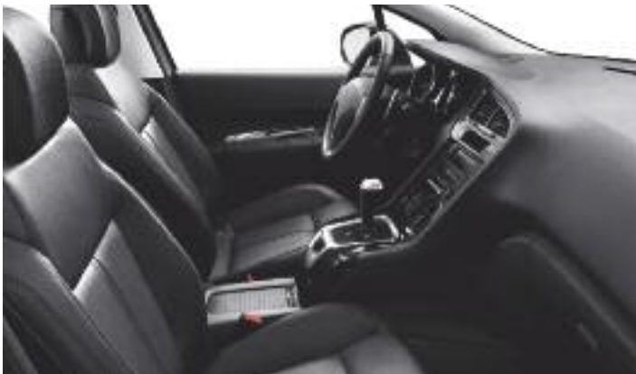
Tramontane Black Leather* (optional)