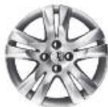
17" QUARK ALLOY WHEELS