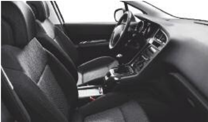
Tissu Tramontane Black Cloth