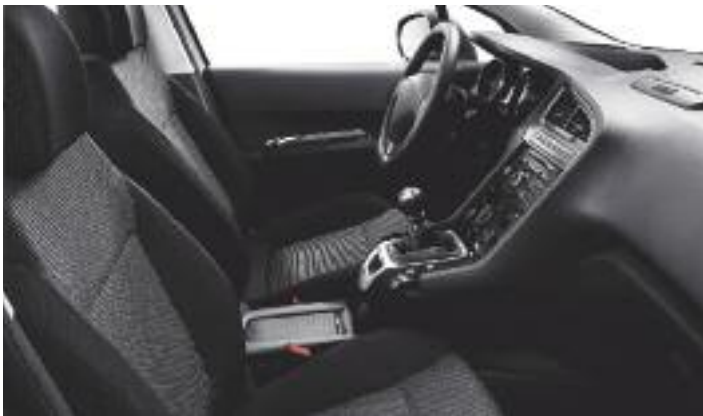
Strada Tramontane Black Cloth