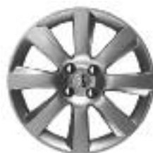
18" MAGNETIC ALLOY WHEELS