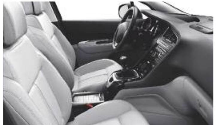
Guérande Grey Leather* ( optional)